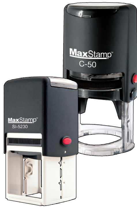
A. C-12 Custom Stamp

PRIORITY ORDER SHIP VIA 2ND DAY OVERNIGHT